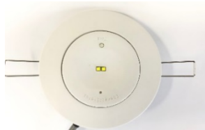
LED Head with Adapter Ring